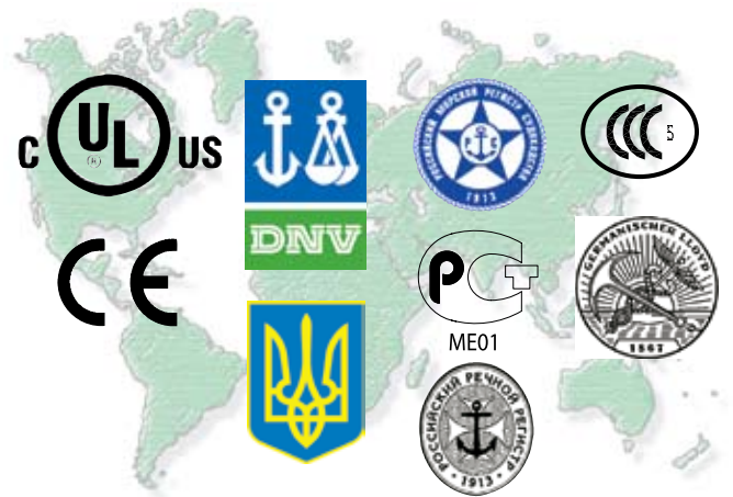
ABB is represented in over 100 countries. Our pilot devices meets all major international and national standards.