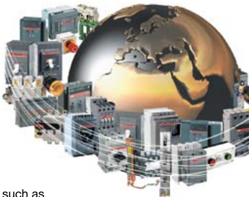
ABB offers a complete range of 22 and 30 mm Pushbuttons, Emergency Stops, Selector Switches and Signalling units. These are complemented with enclosures and a wide range of accessories.

The main advantages are the robustness and the fast and easy installation ensuring cost efficiency for our customers. The ABB Pilot Devices are suitable for all types of industrial environments, indoor as well as outdoor. Other sectors of common usage include trucks, buses, trains and official buildings.